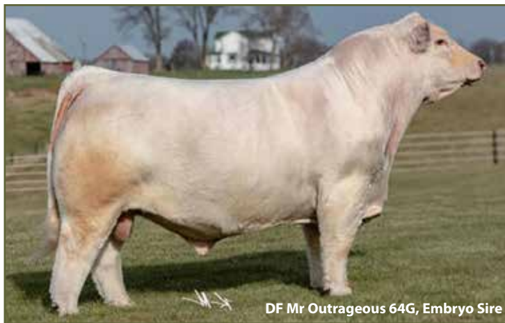
DF Mr Outrageous 64G, Embryo Sire