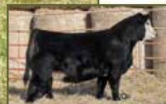
NAGE Khalua, Sire