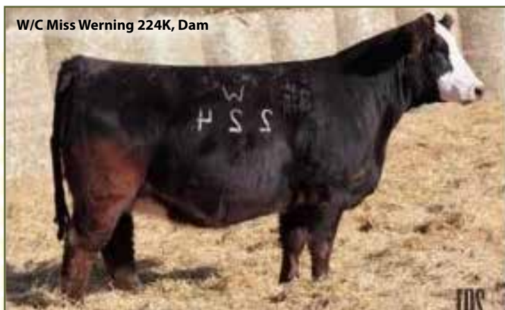
W/C Miss Werning 224K, Dam

224M possesses, we feel she will be able to make both high end show cattle and production cattle alike. Heres your chance to own a piece of the best cow family the Simmental breed has ever seen!