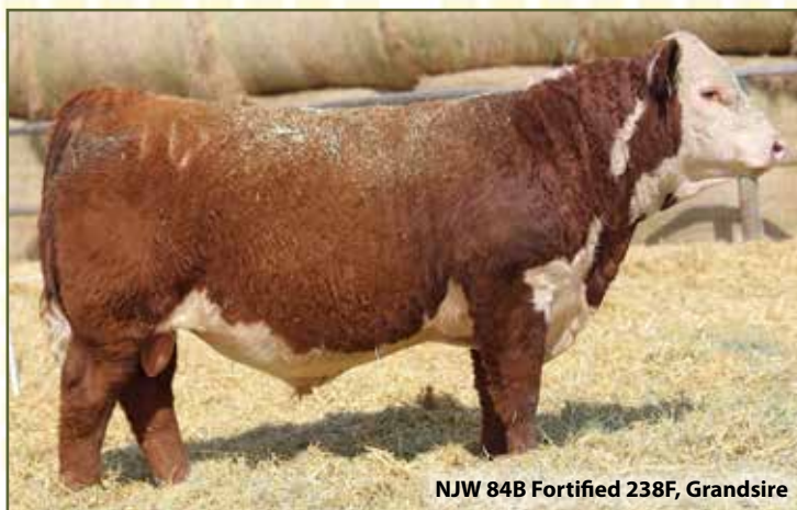
NJW 84B Fortified 238F, Grandsire

We are excited to offer this dark cherry red heifer. She is super feminine and ultra sound on the move, yet she still offers plenty of body and rib shape. She is moderately pigmented on both eyes. She will definitely stand out in the pen whether she is in the replacement pen or the show pen!