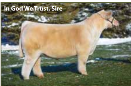
In God We Trust, Sire

This steer has been a stand out since he was born. He carries a long high set neck topped with a big ole wide head. This thing is big footed, big boned and has hair for days. He has all the right pieces to make a quality fat steer. Everyone loves a great baldy!