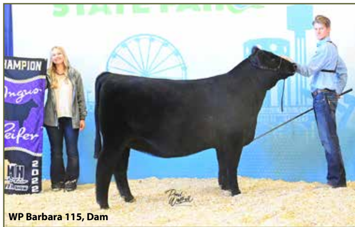
WP Barbara 115, Dam