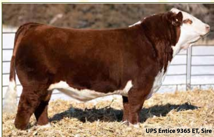
UPS Entice 9365 ET, Sire

Full sib to the 2024 Reserve Champion heifer at MN State Fair Open Show. I really like this heifers balance and look, smooth fronted, big bodied and stout featured best describes her.