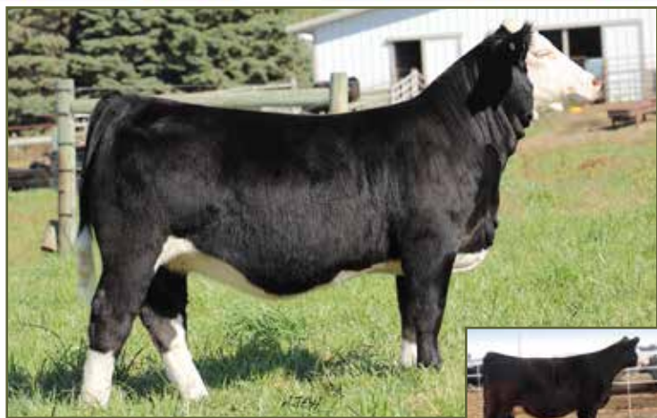
HILB Lace N Lillies F2S, Dam

County O mating. She stems from one of our favorite cow families in terms of udder quality and mothering ability so bid with confidence, this girl will make you money when she's done on the tan bark! Video will be available closer to sale day.