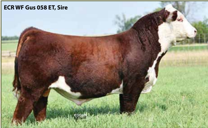
ECR WF Gus 058 ET, Sire

Fonzie has the front and profile you want in a show steer, while still being stout bone and thick-ended. He has the hair, bone, muscle, and look to make a great Hereford show steer.