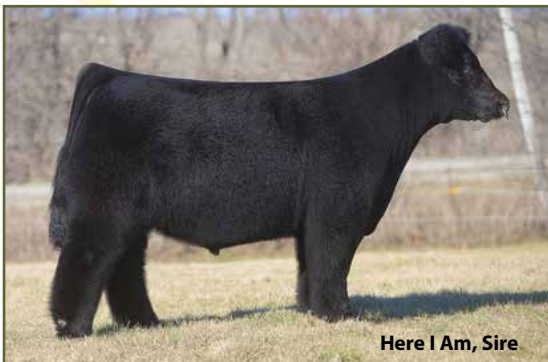
Here I Am, Sire