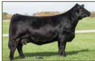
HF Serena, Grandam