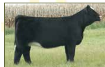
HSF Baby Doll W959, Grandam