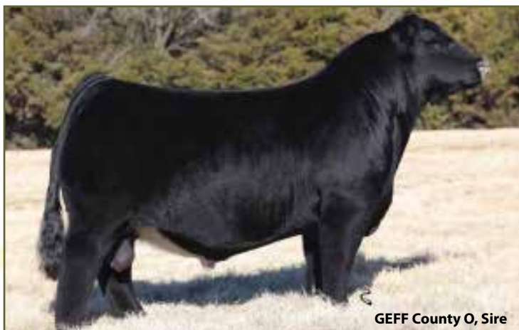
GEFF County O, Sire