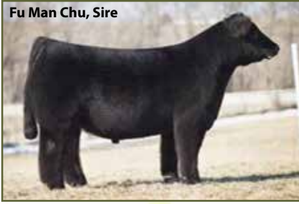
Fu Man Chu, Sire