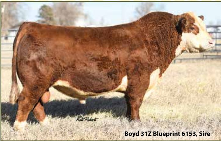
Boyd 31Z Blueprint 6153, Sire

cow and a nice show heifer for a young shower as she is gentle. She is the only heifer from this mating that I will be selling, the rest will all be replacements. Check her out !!!!