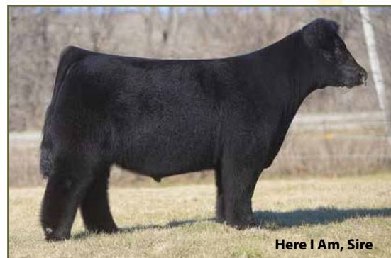
Here I Am, Sire

You will never have to worry if this guy will be a picky eater or get big enough. He is very aggressive at the feed bunk, with a big bold rib shape and he's no toad. This steer has a real stylish look, great top and hip, and a tremendous set of running gear that he gets out and motors on. A splash of white on his face will get you noticed in the ring. Good disposition.