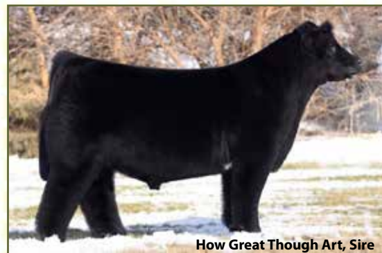
How Great Though Art, Sire

This is a big red burly Maintainer ready for the tan bark.