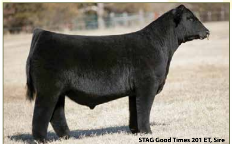
STAG Good Times 201 ET, Sire

SCC SCH 24 Karat 838 STAG Good Times 201 ET SCC SCH Phyllis 6104 Dameron Jensen Shadoe 933 of FAF Champion Hill Shadow 5946