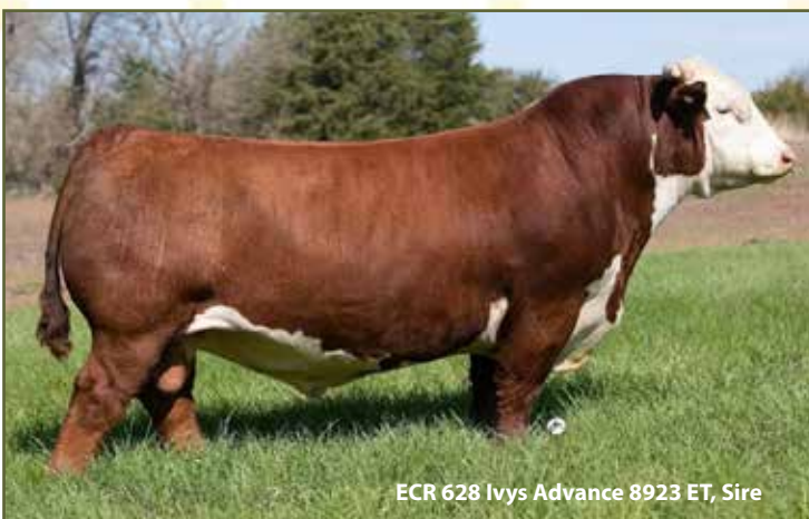
ECR 628 Ivys Advance 8923 ET, Sire

If you're looking for one that'll make it as a heavy bred in the ring next state fair season, look no further than this Good Times daughter. This female excels in her build and elegance of look, as she has continued to develop, she's never given up an ounce of freshness. When her time in the ring is done, she'll make an impressive front pasture female.