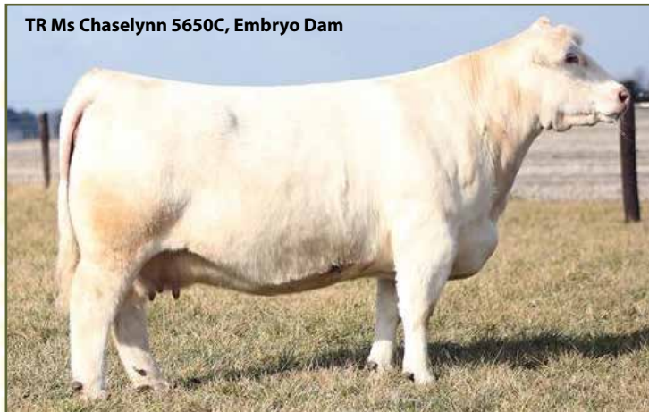
TR Ms Chaselynn 5650C, Embryo Dam