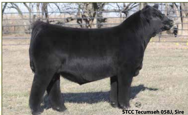
STCC Tecumseh 058J, Sire

When deciding what to put on this sale, we knew we needed something a junior could make the most of, not only in the show ring but in production. Mia is the sweetest heifer, being worked with and shown by our 7-year-old nephew. Her disposition is just icing on the cake; she is something to breed off, enough red in her pedigree to get you color, stout enough to make herd bulls or steers, and yet maternally made to make them front pasture purebred or percentage replacement heifers.