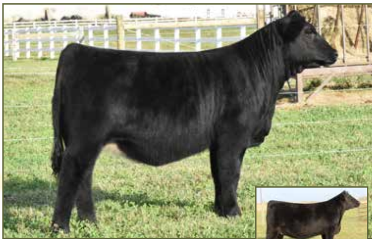
WCS Vizzy 12J, $7,500 Maternal Sister