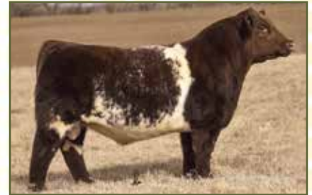
HAHN Popular Opinion C7G, Sire

Hill Haven Cognac 39B HAHN Popular Opinion C7G HAHN Elizabeth T32B RS After Hours ET ESF Ellie May ET SPRV True Blue Y033