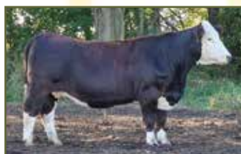
RIR Bank On Me Baby, Dam